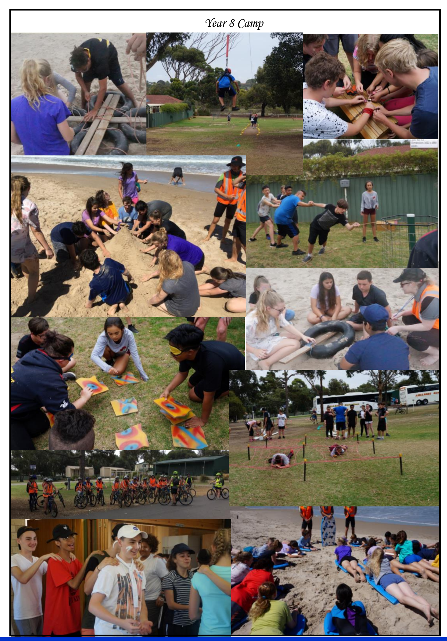
CREATE * INSPIRE * EXCEL